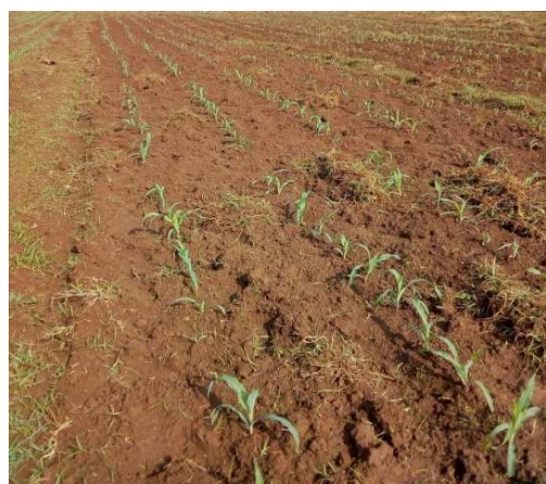
Figure 3. 1 st cultivation practice.