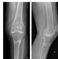
Figure 6. a-b: X-rays at 6 months (patient 2).