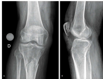
Figure 1. a-b: Emergency X-rays, patient 1.

All patients had an ASA score of III. One patient had an associated fracture of the ipsilateral proximal humerus that was treated conservatively. Another patient had a Lisfranc lesion on the contralateral foot, also without indication for surgical treatment. All the tibial fractures were closed, metaphyseal, graded 41A2.1 and 41A3.3 according to the AO system [13] (figure 1a-b, figure 2a-b). Assessment of the soft tissue envelope has been done according to the Tscherne classification. The classification addresses soft tissues from grade C0 (little or no soft tissue damage) to grade C3 (extensive skin contusion, myonecrosis, degloving, vascular injury or compartment syndrome) [14, 15].