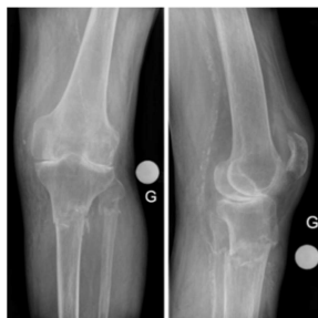
Figure 2. a-b: Emergency X-rays, patient 2.

Since all three patients suffered from soft tissue injuries to the proximal tibia, ranging from grade C1 (superficial abrasion, figure 3) to grade C2 (deep abrasions, impending