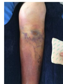
Figure 3. Superficial abrasions and contusion of soft tissues (grade C1, patient 2).

This strategy allowed the management of the soft tissue injuries without any complications, during and after the procedure. The post-operative mobilization protocol allowed immediate knee mobility and full weight bearing. The patients remained in the orthopedic ward for an average of 12 days before being transferred to rehabilitation. Outpatient X-ray were performed at 6 weeks and 3 months postoperatively, finding no cut-through of the proximal tibia wires. There has been no pin tract infection. External fixator removal procedures were undertaken for two patients at 3 months and one patient at 6 months. Standard X-ray views 6 months after external fixation showed that complete consolidation had been achieved (figure 5a-b and figure 6a-b).