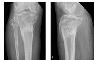
Figure 5. a-b: X-rays at 6 months (patient 1).