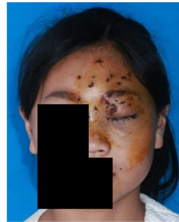
Figure 1. The patient who received a gunshot wound after emergency treatments at the local hospital and before navigation-guided surgery.

the brain parenchyma. Except for left eye vision loss, there was no abnormal physical or laboratory test. Spiral computed tomography (CT) scan of the head was performed. The CT data, with 0.625-mm slice thickness, were imported into the iplan software of the VectorVision 2 navigation system (BrainLAB, Feldkirchen, Germany). In the iplan software, the buckshots could be clearly viewed. A virtual three-dimensional (3-D) model was built to show the nine buckshots of 5 mm in diameter.