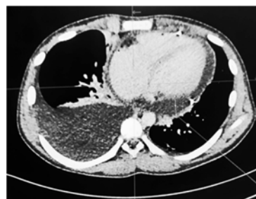
Figure 1. Axial CT image showing pericardial effusion.

Tazobactam & double dose Metronidazole. Fluid input output monitoring was done. High protein diet was advised and adequate chest physiotherapy ensured. CECT chest and abdomen was done. A guided pigtail catheter was placed in the liver abscess, thus draining the source. Hepatic pigtail drained 200ml anchovy sauce pus over 3 days. After 48 hrs. of pericardiocentesis, repeat echocardiogram showed minimal pericardial effusion and the pericardial pigtail catheter was hence removed. Patient's TLCs became normal with normal heart rate. Repeat abdominal ultrasonography revealed a collapsed abscess site in the liver, hence hepatic pigtail was removed thereafter. His symptoms gradually improved after 3 days and was later discharged.