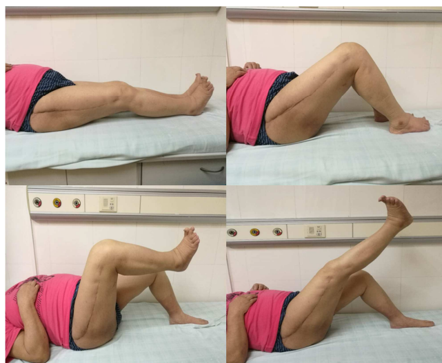
Figure 2. General photo of the patient's hip joint function on 1.5 years after revision.

Images A and B respectively show the frontal X-ray of the fracture around the prosthesis after the first artificial hip replacement. C and D show the AP and lateral X-rays of the patient at 1 month after revision. E, F, G shows the patient's X-ray on 1.5 years after revision.